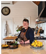
Annie Smithers Home Artisans in the Kitchen

Matt Preston is a food writer, cookbook author, and radio host.