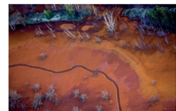
INDUSTRIAL SCARS: Aerial view of a large industrial site, possibly a coal mine or power plant, showing extensive infrastructure and machinery. The image is part of the 'Industrial Scars' series by J Henry Fair.