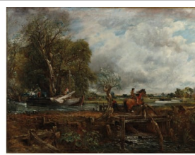
John Constable, The Leaping Horse, 1821 Oil on canvas, 100 x 125 cm Royal Academy of Arts, London