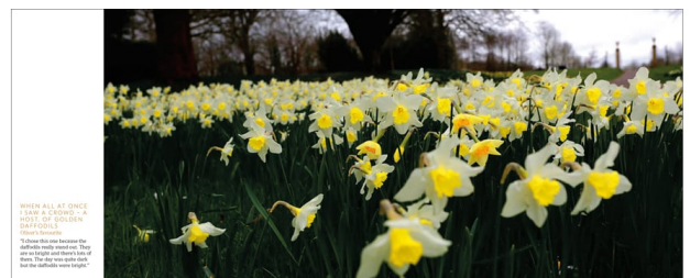
WHEN ALL AT ONCE I SAW A DANCE A field of daffodils in bloom. The yellow is so bright, it's almost white. The daffodils are so close, they look like a sea of yellow.