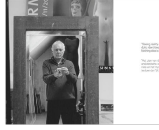
Nothing also is fuilt to me than imitate this "searing it" Hot zion van de werkelijkheid als één entiteit die he