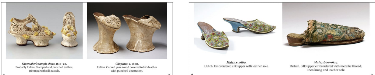
Shoemaker's sample shoes, 1600–20. Probably Italian. Stamped and punched leather; trimmed with silk tassels.