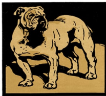
THE BRITISH BULL-DOG

Sir William Newzam Prior Nicholson (1872–1949) was one of the most talented and versatile painters ever to work in Britain. A creator of astonishingly precise and delicate still lives, and of some of the most penetrating portraits of the century, he also pioneered a vigorous style of woodcut illustration that remains unequalled for its strength and subtlety. His son was the painter Ben Nicholson.