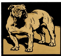
THE BRITISH BULL-DOG

Sir William Newzam Prior Nicholson (1872–1949) was one of the most talented and versatile painters ever to work in Britain. A creator of astonishingly precise and delicate still lives, and of some of the most penetrating portraits of the century, he also pioneered a vigorous style of woodcut illustration that remains unequalled for its strength and subtlety. His son was the painter Ben Nicholson.