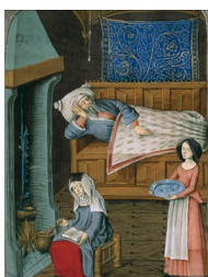
1. PEASANTS & PROFESSIONALS