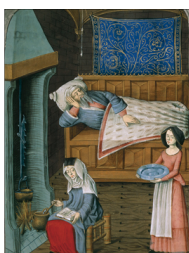
1. PEASANTS & PROFESSIONALS