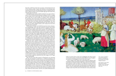
3. MEDIEVAL WOMEN