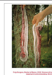
Fraga Bergsma, Buster of Bones , 2018. Viscose silk with digital print and embroidery, 100x100 cm