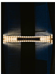
INTRODUCTION THE SUBSTANCE OF HUMANITY KORCHIATO

Kengo Kuma decided at a young age to pursue architecture, having been inspired by Kenzo Tange's Yoyogi National Gymnasium, built for the 1964 Tokyo Olympics. He studied architecture at the University of Tokyo and received his master's degree in 1979. In 1990, he established Kengo Kuma & Associates (KKA). Headquartered in Tokyo, the firm also has offices in Paris, Beijing, Shanghai, and Seoul, and Kengo Kuma & Associates projects are currently underway in more than fifty countries. Kengo is currently a university professor and professor emeritus at the University of Tokyo, and a member of the Japan Art Academy after teaching at Keio University and the University of Tokyo.